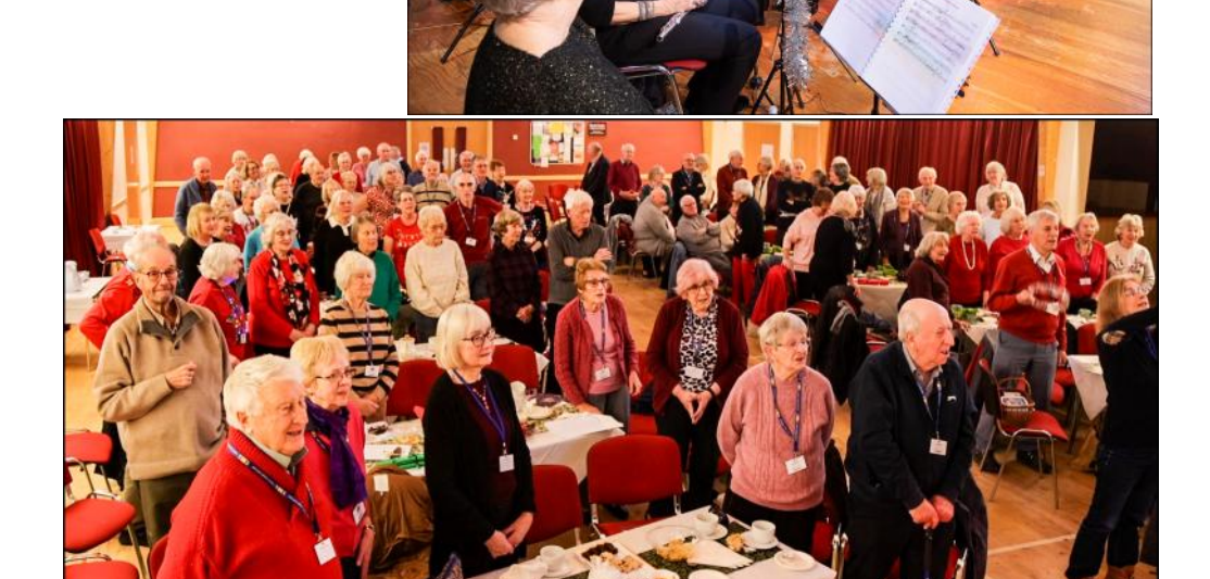
And we ended our meeting with a rousing rendition of We Wish You A Merry Christmas.