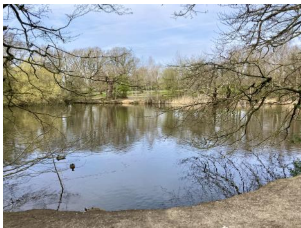
photo opportunity the last part of the walk took us through woodland, and a path between houses to arrive at the Parish Church of St John The Baptist, and then onto the ridge with stunning views towards the south and Hanningfield Reservoir in the distance.

After a short distance we made our way through a gateway into Danbury Country Park, passing three lakes which brought back happy memories for some of having played with children (and grandchildren) in the woods nearby. After a brief stop to watch the ducks, and a second