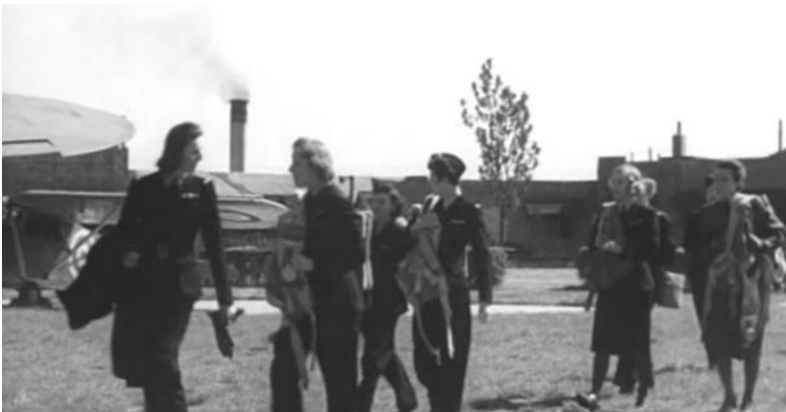
A still from the IWM Ferry Pilot DVD

In five years over 309,000 aircraft were ferried by 1250 pilots, 168 of whom were women, from 25 countries.