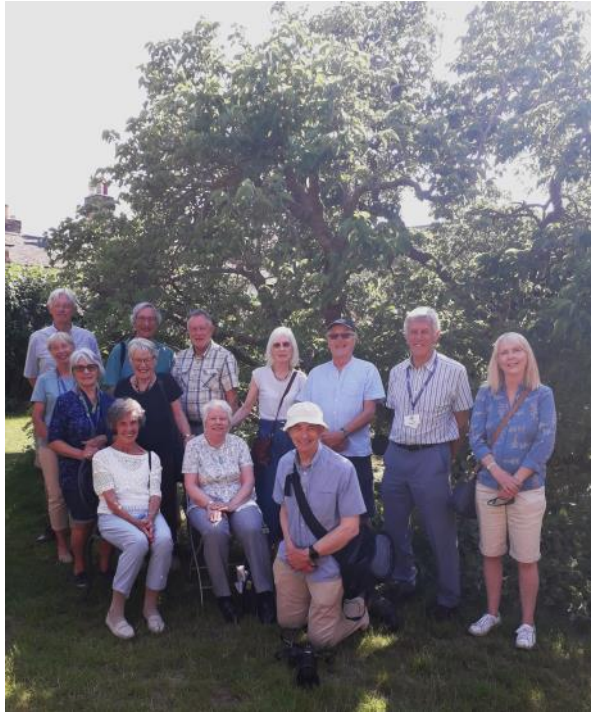
In front of the 300 year old Mulberry tree

Sadly, Gainsborough's Blue Boy has been returned to the Huntington Collection in California after a brief visit to The National Gallery in 2022