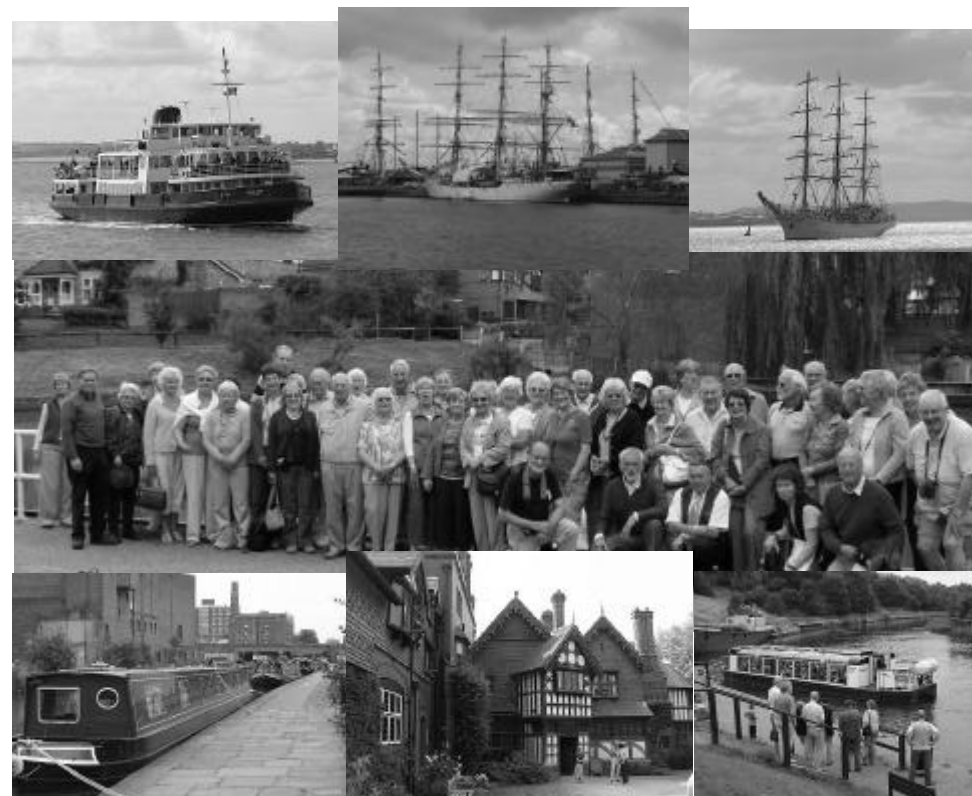
The intrepid Maritime Group visiting Chester & Liverpool and the Tall Ships Race on a four day trip in July